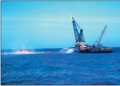
Some spills present specific safety risks

Responses to oil spills inevitably put responders and chemicals together in the same environment. Potential exposure of personnel should be assessed, monitored, and controlled if health effects are to be avoided. Each type of product, when spilled into the environment, will have its own set of chemical characteristics that will determine the most effective response strategy and, indeed, which strategies are safe to use. It should be borne in mind that the chemical characteristics of the spilled product will usually change over a period of time as a result of what is known as ‘the weathering process’, i.e. the action of the elements on the product and its reaction with the surroundings.