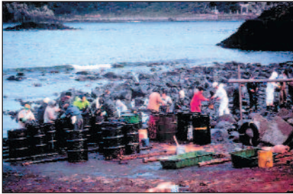
Volunteer activities must be coordinated and the safety aspects managed.