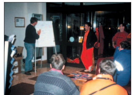
Briefing the response team prior to a day's operations