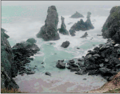
Oil spills invariably bring out the worst in the weather.