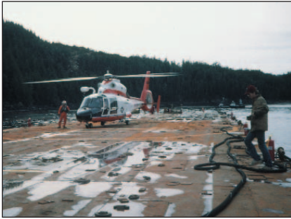
Aircraft can play a significant role in response operations.