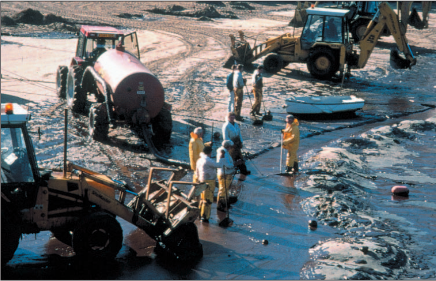
Shoreline clean-up operations need to be managed carefully to prevent accidents.

It is essential that shoreline responders are trained to recognize the hazards present in their working environment, and are provided with adequate means to control the risks.