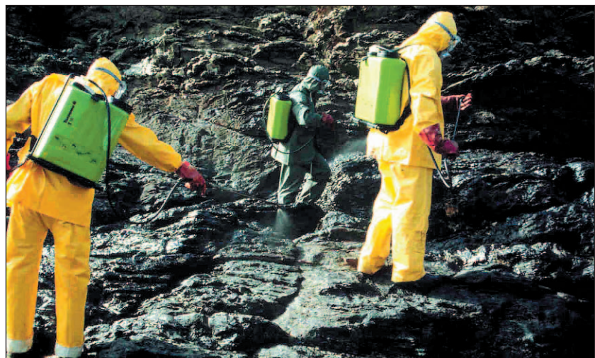
Appropriate PPE must be used when using dispersants.