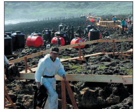
Providing safe access to the worksite is critical to reducing the risk of accidents.

As mentioned previously, the most common hazard to responders is the danger from slips, trips or falls. Oil spills can occur in locations where the access to the work site is difficult. The problem is compounded when the surface is coated with oil, but rocky shorelines can be naturally slippery due to seaweed, wet rocks or mud. Safe and secure access must be provided for the workforce to prevent the possibility of injury. When working on the shoreline, it is advisable for responders to keep clear of cliffs or rocky shorelines until a safe means of access has been provided, either in the form of access bridges or guide ropes. Clean-up crews should be warned of the hazards of any particular site access and be given