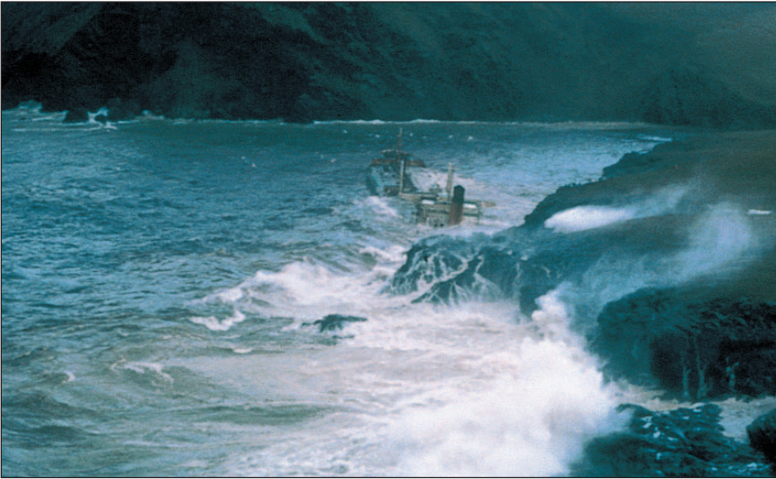
The natural environment can present a significant risk.

Although indigenous flora and fauna are often an important ecological and environmental resource, they can present a very real safety issue. Poisonous plants and dangerous animals need to be identified, and their appearance publicized to the responders along with information on how to deal with the threat they present. Of greater concern are those creatures that may actually attack humans both in the sea and on dry land. Where these possibilities exist, expert advice must be obtained and adequate protection provided.