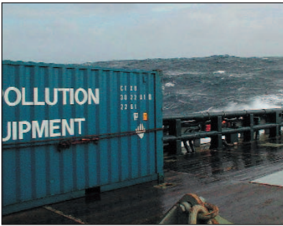
High seas conditions can make vessel operation hazardous.

increased risk when operating offshore and, where possible, regular local workers acting as safety escorts should accompany them. A personal floatation device must be worn by all responders working offshore and in vessels, because swimming ability is impaired by clothing such as boots and helmets. Vessels engaged in offshore response work should be suitably sized and equipped to deal with the environment. Adequate and suitable safety and communications equipment should be installed on the vessels. Crews should be trained and competent in the operation of the vessels and responders should be trained and fully briefed on their responsibilities.