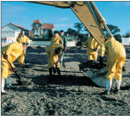
Shoreline deployments require extensive management (see box below).

The extent and potential threat of these hazards must be taken into account before committing responders to any particular activity. If there is a risk, suitable and appropriate countermeasures and plans should be established, communicated and tested.