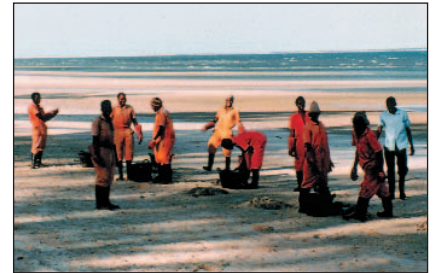
A properly equipped, well motivated team is a major asset

The working environment will often dictate the PPE selection criteria. For example, cold weather environments require the use of thermally insulating clothing. This type of clothing can be rendered unusable if it comes into contact with liquid oils, hence a robust and well-sealed impermeable layer should be worn above the cold weather clothing. Conversely, in hot climates, impermeable clothing will exacerbate the problem of heat stroke. Workers should therefore be given adequate rest breaks and liquids to ensure their welfare, or an acceptable compromise should be reached in the type of PPE that they wear.